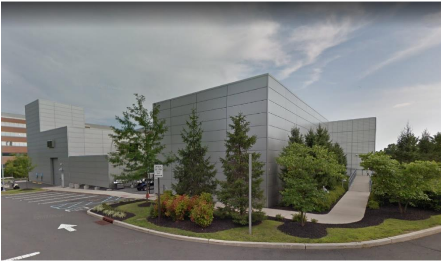
Penn Medicine Princeton Medical Center in Plainsboro, NJ